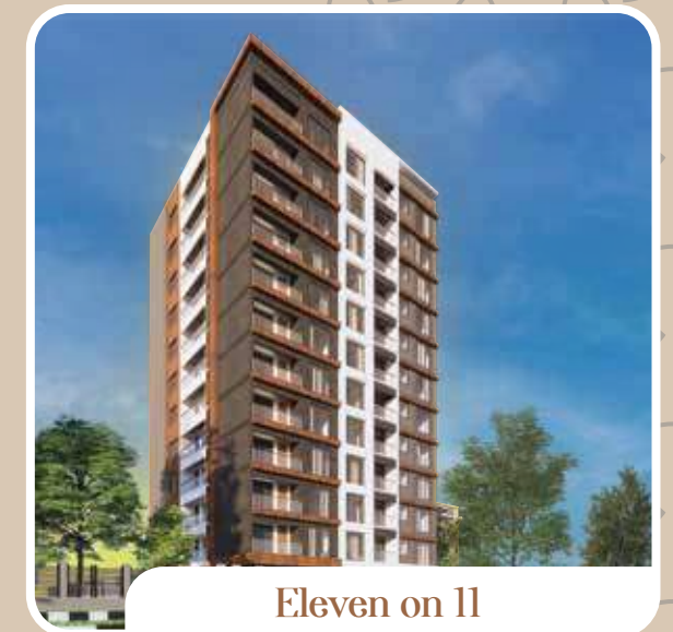
Eleven on 11